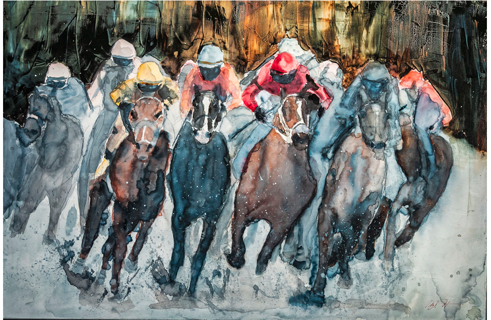
2021 Autumn Art Festival Best of Show, Home Stretch by Brad Hawn

Works must be original, recent and created solely by the artist. Work done under classroom supervision is not acceptable. No work previously exhibited in Autumn Art Festival is allowed. Submitted works of art must be physically brought into the gallery to be juried into the show. Pieces that are not accepted need to be picked up on the dates listed below with no exceptions.